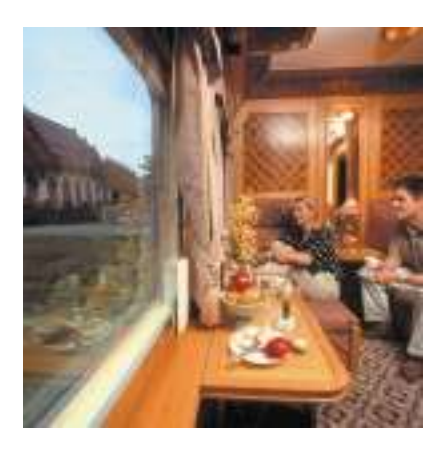
Eastern and Oriental Train