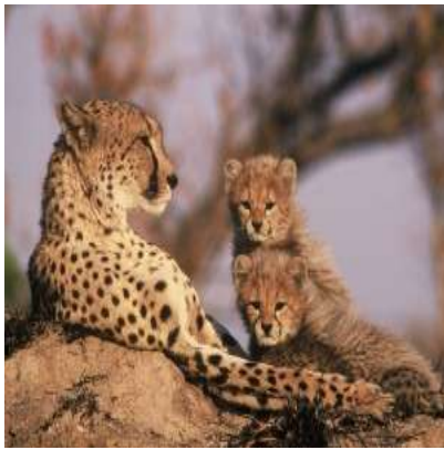
See the movie "African Cats" before you go!

Explore the best of both Kenya and Tanzania on this classic small group overland experience that follows a circular route incorporating all the major parks and reserves in both countries. The highlights are Samburu National Park, Great Rift Valley, Lake Nakuru, Masai Mara, Serengeti and the Ngorongoro Crater.