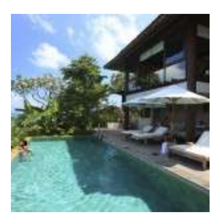
Six Senses Hideaway - Samui, Thailand