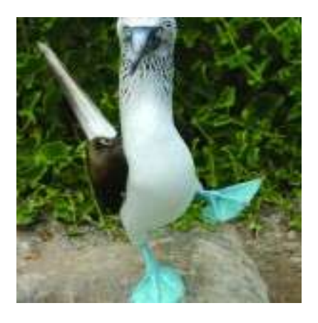
Blue Footed Booby

Book your Galapagos Cruise on the <u>Legend</u>, <u>Coral II</u> or <u>Coral II</u> and choose from either a 10% reduction in price or a free cabin upgrade!*