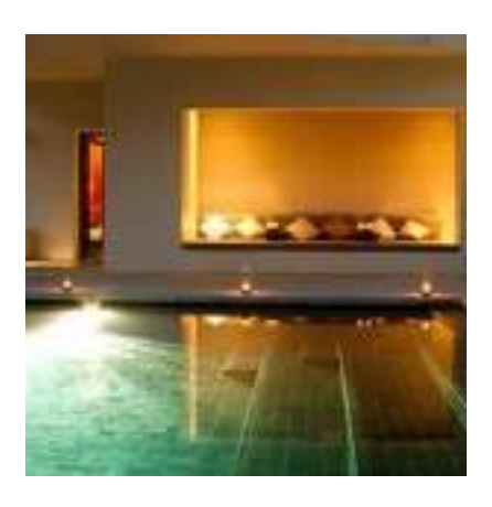
Amansara Pool - Calm Oasis