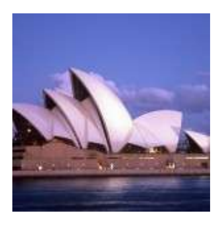
Sydney Opera House

Visit two of Australia's most vibrant cities – Sydney and Melbourne – for one amazing low price. Your vacation package for only $1679 USD includes the following: