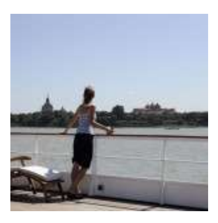
View from the Orient Express Deck