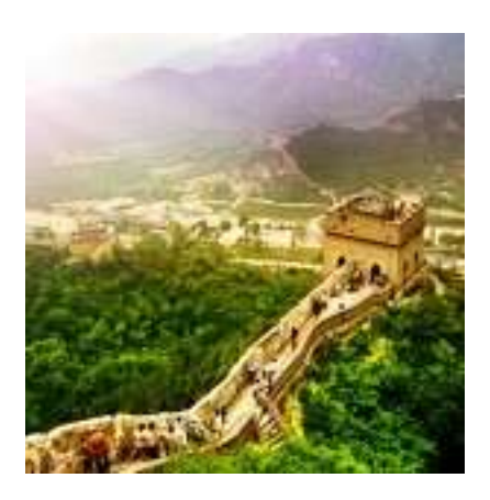
Great Wall Beijing China

For a limited time only, Goway's June 12, 2012 departure is on sale!