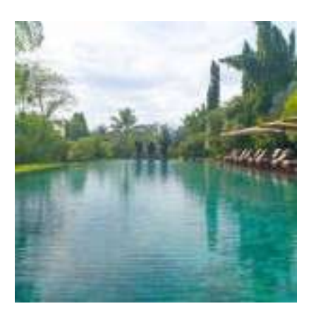
The Pool at the Chedi Club, Ubud

Find spiritual harmony in Ubud, Bali's artistic and cultural capital. This island is magical and unspoiled; a sea kissed haven of volcanic mountains, terraced rice fields, palm groves and sun-dappled roads that lead past picturesque villages to tucked away bays, bordered by white sandy beaches. Beautiful Hindu temples and friendly locals bring cultural depth to this rejuvenating oasis. Make sure to take the time go through the wares of Ubud's many skilled artisans and craftsmen, celebrated for their unique woodcarvings and silverwares, and don't miss nearby Kintamani, where you can see impressive views of Mount Batur, famed for the ribbons of black lava that run down from its peak to the valley floor, forever locked in stone stillness.