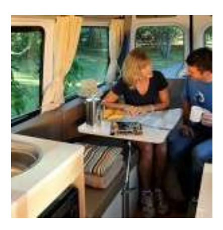
Large Maui Ultima Motor home Interior

If your idea of a real holiday is to have all the comforts of home at your fingertips, whilst having the flexibility to travel wherever the road may take you, then we think a Maui campervan hire is the perfect self-drive option for your New Zealand journey. With the freedom and flexibility to explore NZ at your own pace, you can stay in one place for as long as you like. Because you decide the pace, the only schedule you have to work to is your own.