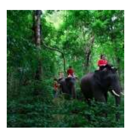
Patara Elephant Camp