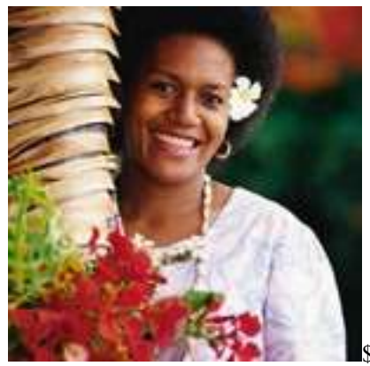
$1699* from L.A.