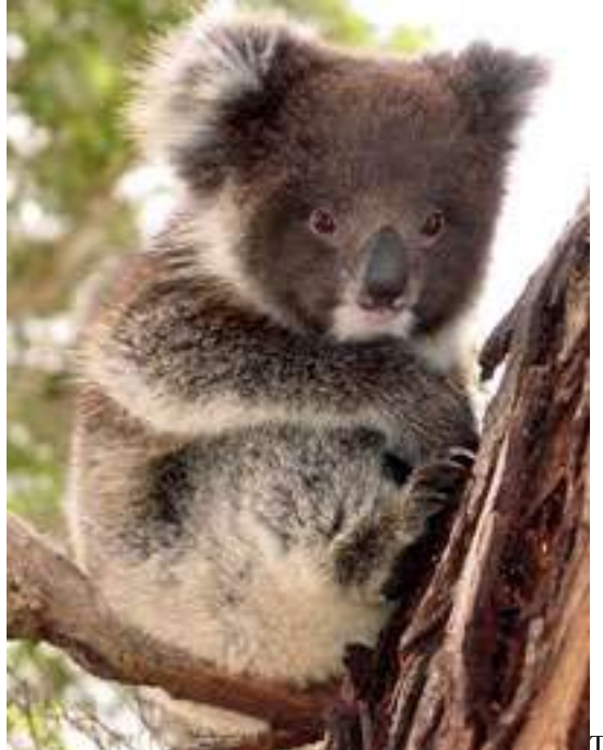
Days 7-11 – at leisure in Sydney

There are a wealth of touring options available to you in Sydney; from Harbour Cruises to a night at the Sydney Opera House, or the opportunity to visit wildlife world to see the kangaroos and koalas!