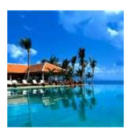
Ana Mandara Nha Trang