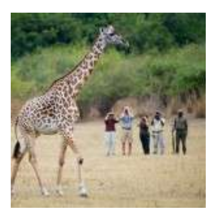
Zambia Walking Safari

Zambia pioneered the walking safari and South Luangwa, in particular remains the finest place to do this type of adventure. The prolific game and unrivalled expertise of the local guides mean that sightings of leopard, elephant, hippo, lion and wild dog are not just rare experiences, but commonplace.