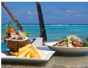
Delectable Polynesian cuisine in Cook Islands