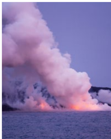
Volcanic splendor on Hawaii, the Big Island