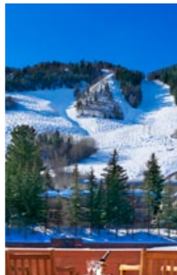
Snowfilled adventure at The St. Regis Aspen Resort in Colorado