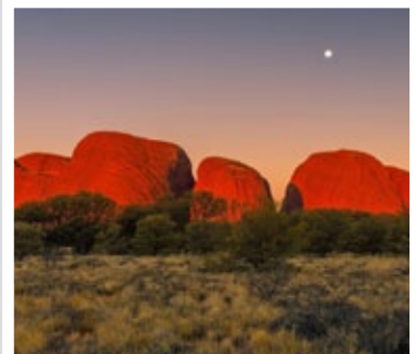
Sunset at Ayers Rock, Australia