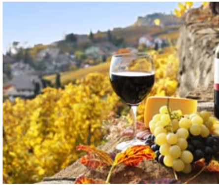
Winetasting in Tuscany, Italy