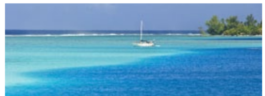
Serene tranquility in Fiji