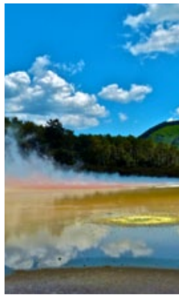
Thermal wonderland in Rotorua, New Zealand