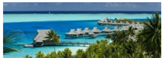
Premier romantic escape at Hilton Bora Bora Nui Resort & Spa, Tahiti