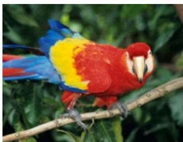
Bird watching in Costa Rica