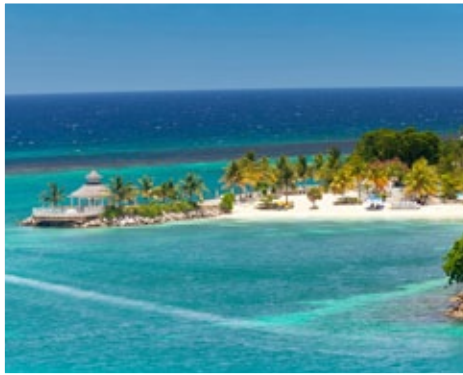
Pure relaxation in Jamaica